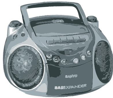
CD player £48.67