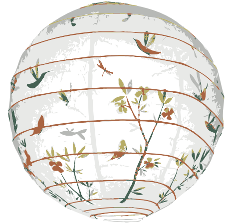
Lamp shade £14.24